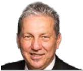
Hon. Dan Vandal Minister of Northern Affairs Government of Canada