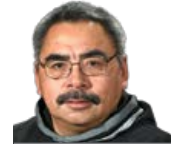
Hon. David Akeeagok Deputy Premier Government of Nunavut